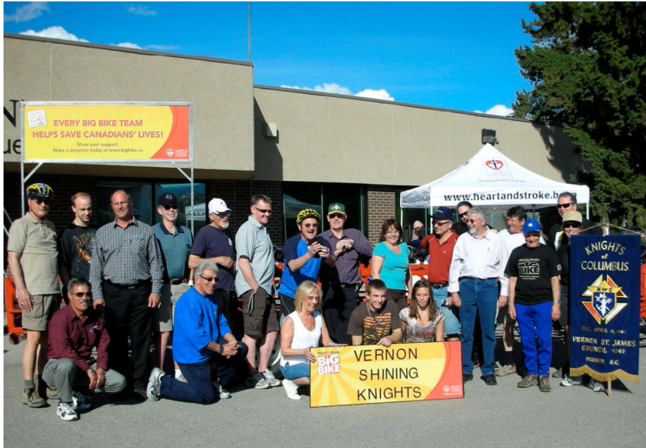
The Shining Knights of St. James Council 4949 before the Big Bike Run

June 2011 St. James Council 4949 - Columbus Court - 301-3003 Gateby Place - Vernon, British Columbia V1T 9H5 -